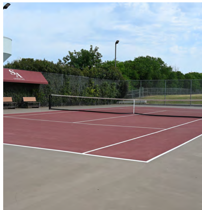
Tennis courts were resurfaced and freshly painted.