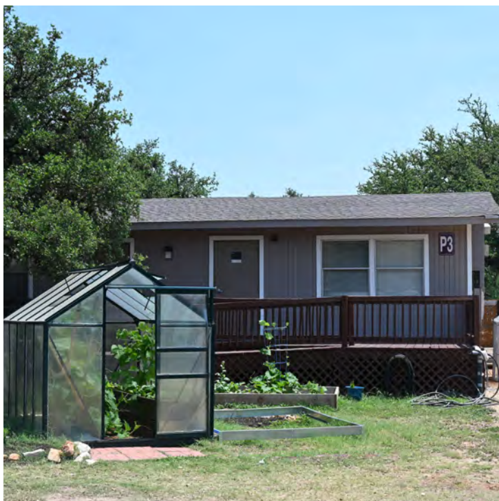
Portables were updated with fresh paint.