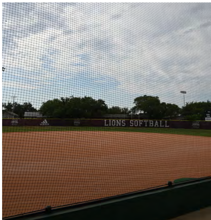
High School family donated funds for softball field safety net.